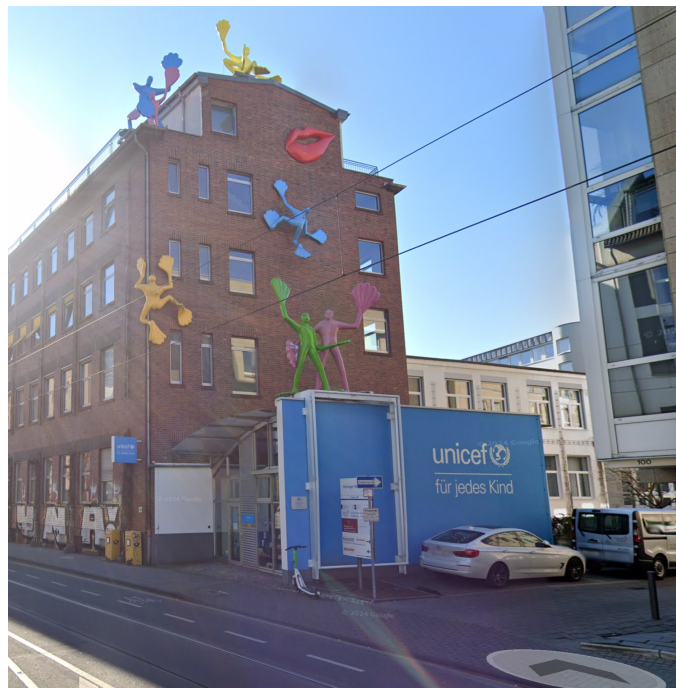
FIG. 2. The unicef building

Step 1: Look for the Unicef building with the funny looking statues (Fig. 2), in the direction of Zollstock