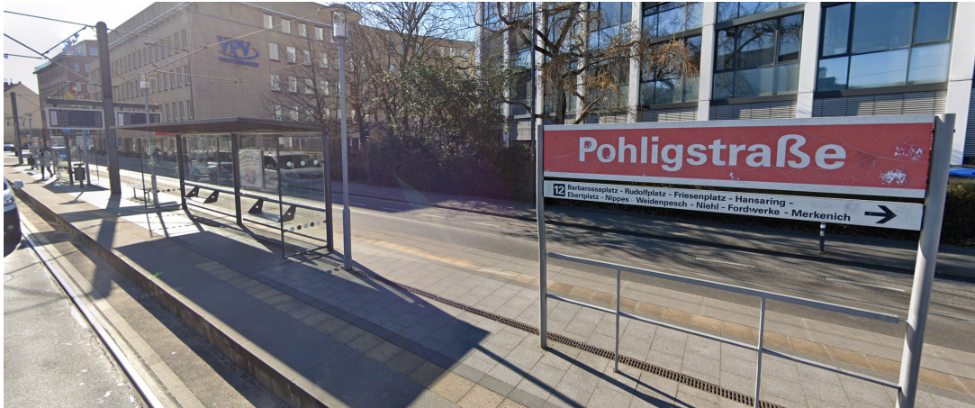
FIG. 1. The tram stop

This list of instructions begins at the the Pohligstrasse tram stop (Fig. 1). If it is unclear how to get here, please refer to other guides. (No but seriously, Google maps)