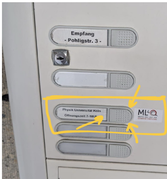
FIG. 4. The button

Step 3: Once at the door, press the button next to the door indicated in Fig. 4